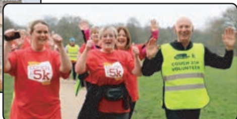
March 2018 edition article page 12