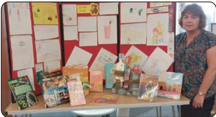
Table being used to display SCART Club Children's Artwork