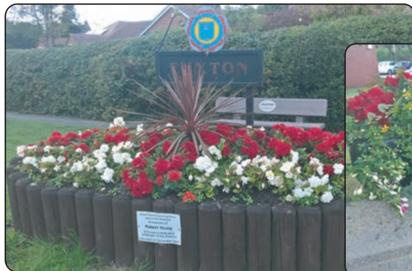
Left. Washington Lane corner with Balshaw Lane