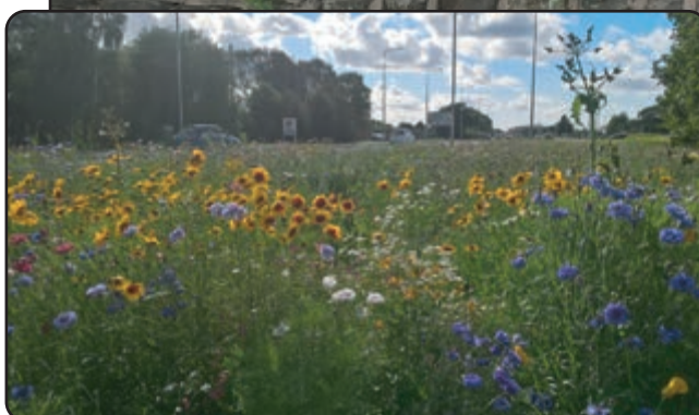
Left. Wildflowers on Euxton Lane