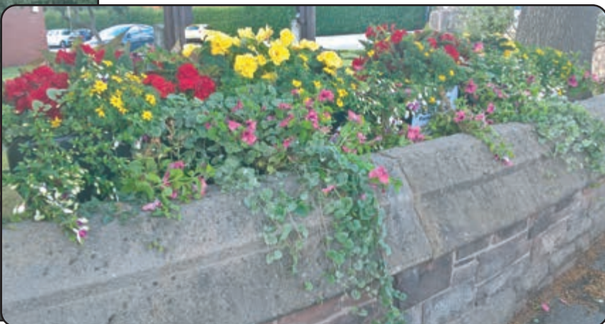
Above. New barrier baskets at St Mary's corner with Bank Lane and the A49 and