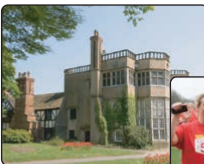
Heritage Lottery Fund bid for Astley Hall conservation and refurbishment