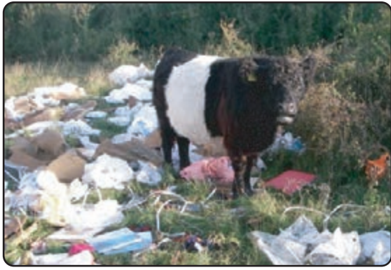
Fly tipping can harm wildlife or farm animals